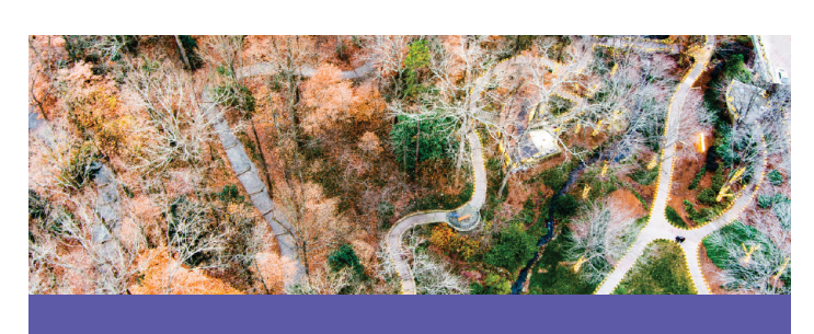
Gorla Ravinia Park – Tucked inside a patch of forest you'll find an impressively cultivated park perfect for a break from everything else.